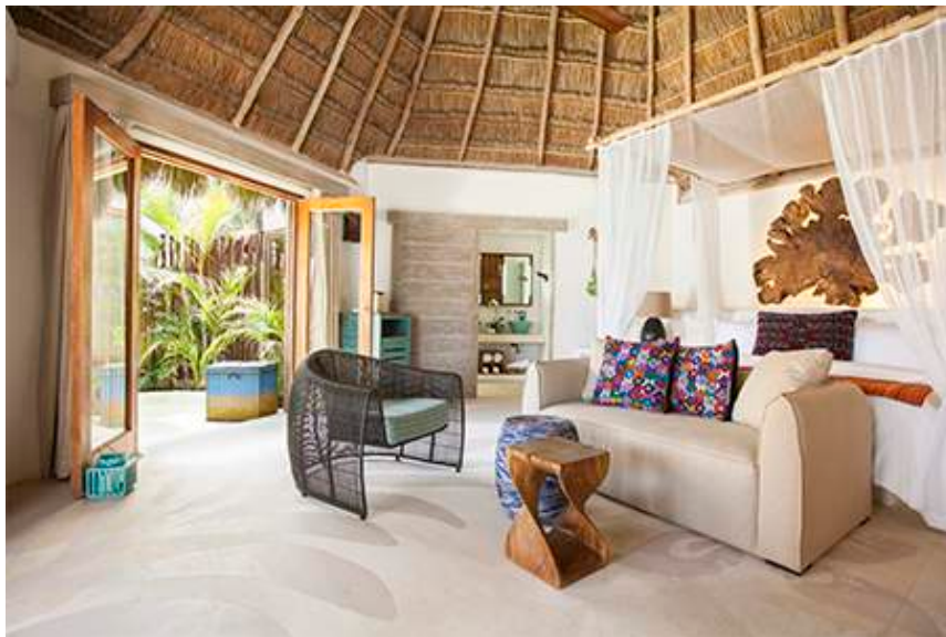
Ocean Front Palapa King