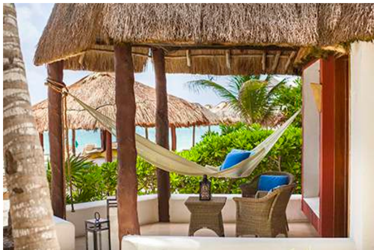
Ocean Front Palapa King Terrace