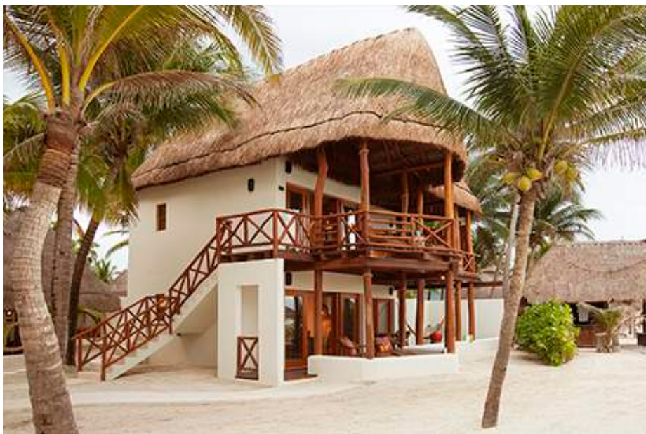
Beach House Palapa

My personal favorite, which is a new room this year, is the Beach House Palapa.