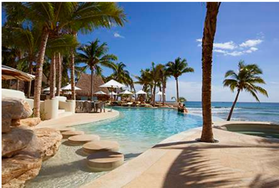
Las Olas Pool